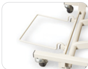
Bumper Bar Protects Walls