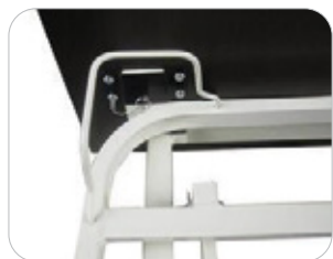
Mattress Retainers included