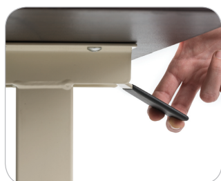
EZ Height Adjustment