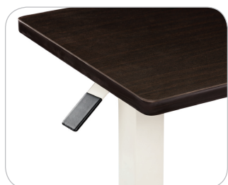
Vinyl Trim protects Table Top & prevents spills