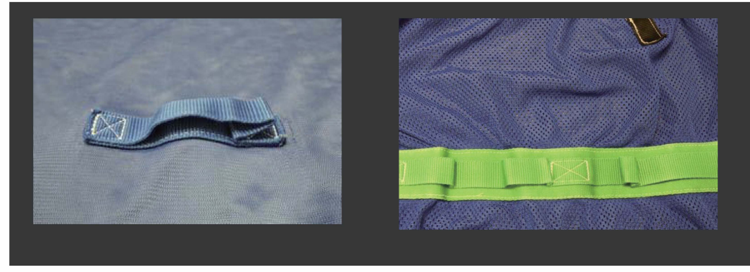
Handle with Permanent Crease

In addition to the loop straps, the back strap and sling handles if present will also show the permanent creases. Permanent creases will tend towards its original wrinkled position even when stretched out.