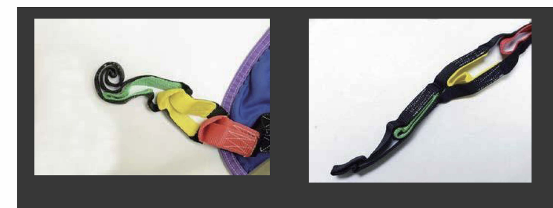
Extreme Loop Strap Curling

Extreme Curling / Permanent Wrinkles of loop straps can set in when the slings are dried at high heat or dried over an extended period of time. Heat combined with bleach or other chemicals will intensify the chemical action.