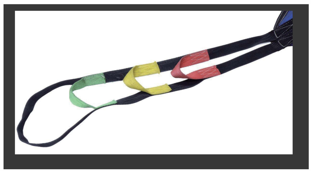
Figure 2 Loop Strap with Normal Wear

Figure 2 shows an example of a loop strap with wear from normal use. Note the absence of permanent crease and surface abrasion.