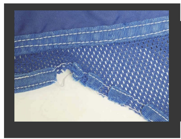
Edge Binding Decomposition

Decomposition of Edge Binding and other components of the sling are clear indicators of degradation from chemical treatment. Color loss and a chalky appearance is common. Stitching (comprised of a different material) may still be intact.