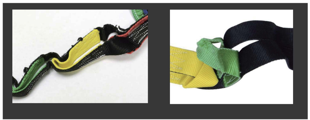
Loop Strap with Excessive Edge Abrasion Stiffened and Brittle Loop Strap

Strap Brittleness / Stiffness / Surface and Edge Abrasion are additional indicators that the sling may have been laundered in unsuitable conditions and has lost tensile strength. Loop straps that have stiffened or become brittle will tend to remain in the state, position, or shape it is bent into instead of returning into a normal relaxed state.