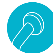
MOUNTS TO THE WALL FOR EXTRA STABILITY