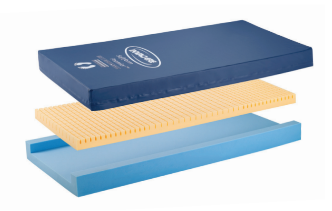
The Invacare® Softform Premier™ Mattress features a unique contoured foam insert which provides excellent resident comfort and optimizes pressure reduction for residents up to Very High Risk . A single piece foam U-core provides side support and helps facilitate resident transfers.

cover is designed to help reduce shear and friction forces, which can be contributing factors in the development of pressure ulcers as well as make the skin tissue more vulnerable to the forces of direct pressure.