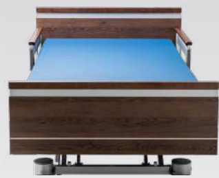
Aura™ Premium 39" with Comfort™ Mattress