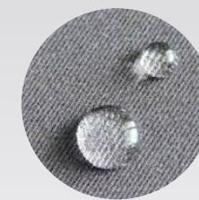
Aura™ Platinum Slate Gray Fabric