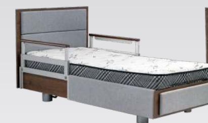
Shown with two rails and Dream™ Mattress