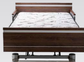
Aura™ Premium Extra Wide 48" with Dream™ Mattress