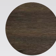
Aura™ Premium Espresso Woodgrain