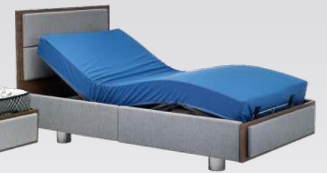
Shown with no rails and Comfort™ Mattress