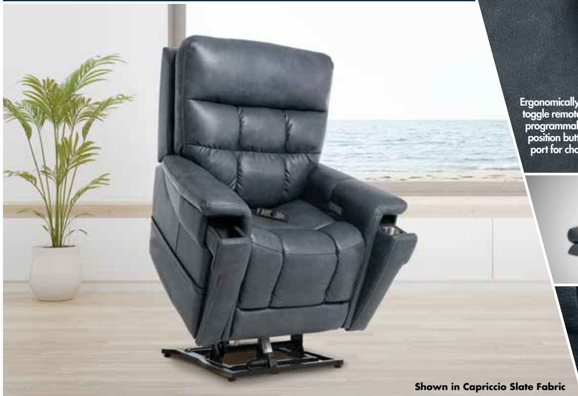
Shown in Capriccio Slate Fabric