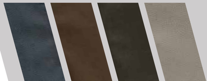
SLATE CAPPUCCINO SMOKE DOVE

(US) 800-800-8586 / (CAN) 888-570-1113 / pridemobility.com